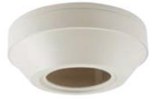
Inst. - S