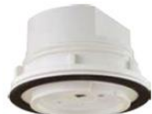
DIP200 - W