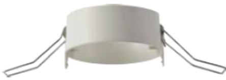
Inst. - R