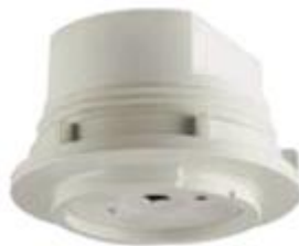
DIP200 - F