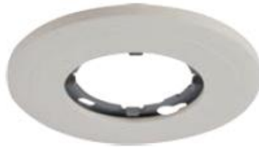
Inst. - C